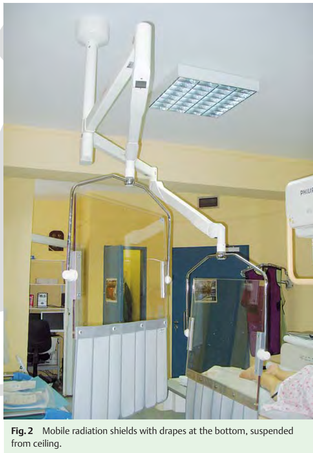
Fig. 2 Mobile radiation shields with drapes at the bottom, suspended from ceiling.

There are no trials available regarding this issue but radiation-warning lights inside and outside the examination room are recommended; they must operate automatically [68]. Regulations