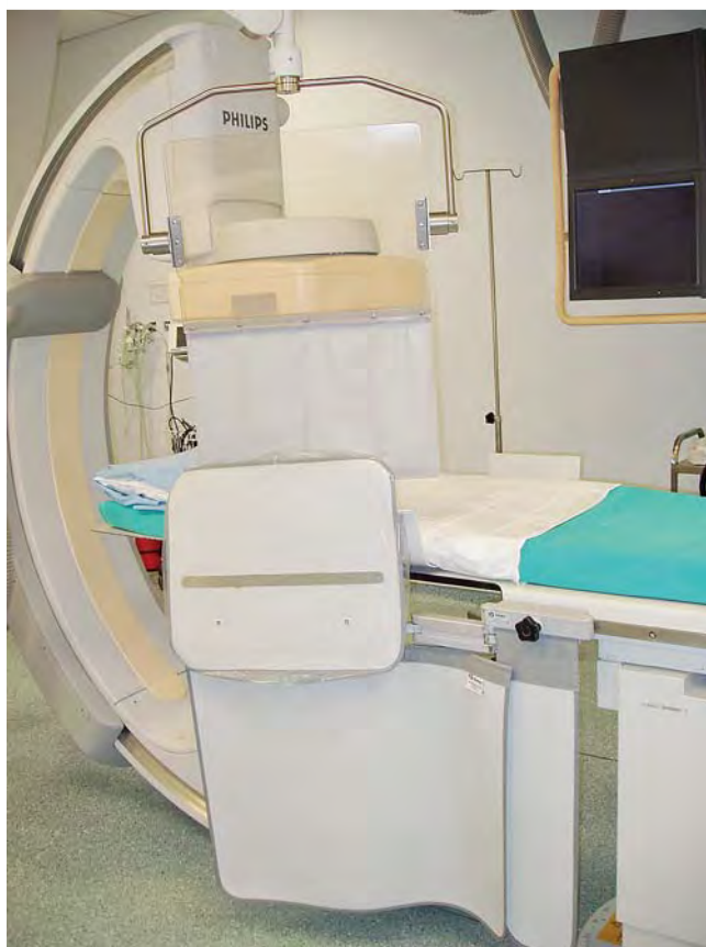
Fig. 3 Under-couch X-ray system with protective radiation shields placed under and over the table, to protect the endoscopist from radiation that originates from the X-ray tube and from the patient (scattered radiation), respectively.

about warnings that are activated when X-rays are being delivered vary considerably between EU countries (e.g., warning lights outside of the room are legally required in Greece). Doors leading into the X-ray room must have signs that indicate the presence of the X-ray unit. Notices that ask patients to inform about possible pregnancy should be posted at the reception area [69].